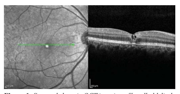
Figure 1: Spectral-domain OCT imaging of handheld diode laser-induced maculopathy. Examination at presentation showed focal disruption and cystic appearance in the inner and outer retinal layers.

cystic cavity did not improve, and visual acuity decreased to 6/30 at the time of examination ten days later. Subsequent fundus examination revealed a vitelliform-like lesion with faint whitening at the level of retinal pigment epithelium. Fundus autofluorescence imaging demonstrated a central hypo-fluorescent lesion secondary to retinal pigment epithelium atrophy. OCT showed a progression to a fullthickness macular hole with surrounding cystoid cavities at the outer plexiform layer and nodular excrescences at the level of the retinal pigment epithelium at six weeks after the initial injury (Figure 2). The patient underwent pars plana vitrectomy, posterior hyaloid stripping, and placement of a 15% C3F8 gas tamponade (GY). Attached vitreous was detected at the time of surgery and no perioperative complications were observed. Visual acuity in the right eye increased to 6/12 in the first month postoperatively. On fundus examination, a small, hypopigmented scar persisted in the fovea which could account for his visual acuity score. Postoperative OCT showed normal foveal contour with a central macular thickness of 275 µm, complete hole closure and resolution of the cystoid cavity.